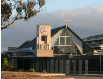
Holy Spirit Amaroo