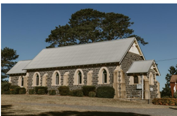
St Francis Xavier Hall