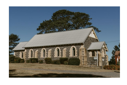
St Francis Xavier Hall Saturdays 5:00pm Starting 6 January 2024