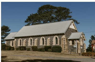
St Francis Xavier Hall