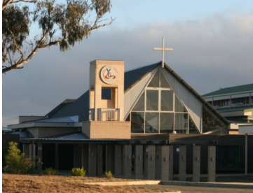
Holy Spirit Amaroo