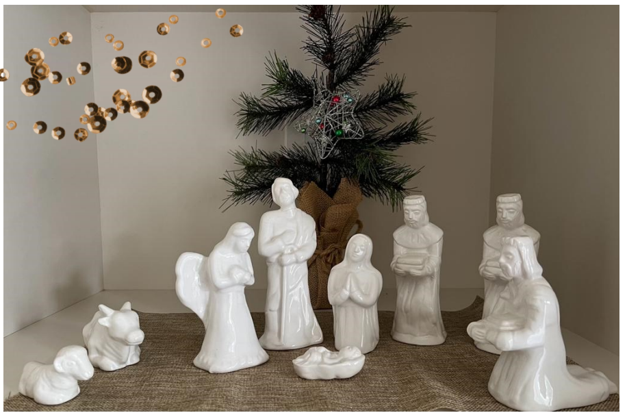
Ghylanne—My nativity scene since December 1993