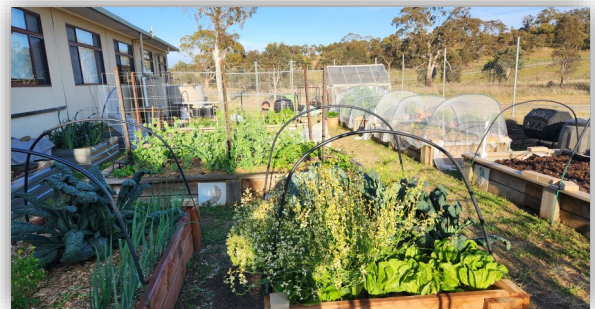
The Parish Community Garden

All of us need to think about what we can do to help. At a very local level you can contribute to the compost bins at our Parish Community Garden . We are always looking for vegetable and fruit scraps (no rice, bread, meat or fat because they attract vermin). If you want to know more about the Community Garden you can contact Theivani at the Parish Office theivani@holyspiritgungahlin.org.au